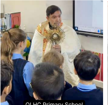
OLHC Primary School